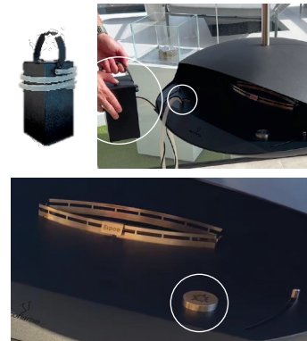
INCLUDE: External Fuel Pump

The built-in sensor detects the temperature of the burner, which completely prevents refilling if the tank is still hot or in use. The bio burner is started quickly on the ignition button. This means that you completely avoid challenges with matches or lighters. The burner can easily be adjusted or switched off.